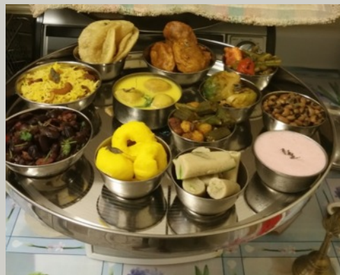
At this point prasadam was served and honored by all.