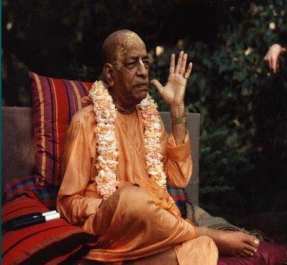
Srila A.C. Bhaktivedanta Swami Prabhupada

Human society is divided into four social orders of life and four spiritual divisions, applying to each and every individual person. This system is called varṇāśrama-dharma and has already been discussed in many places in this great literature. The sages, or persons who completely devoted themselves to the spiritual upliftment of the entire human society, were known as dvija-deva , the best amongst the twice-born. The denizens of superior planets, from the moon planet and upwards, were known as devas . Both the dvija-devas and the devas always establish temples of Lord Viṣṇu in His various forms, such as Govinda , Madhusūdana , Nṛsimha , Mādhava , Keśava , Nārāyaṇa , Padmanābha , Pārtha-sārathi and many others. The Lord expands Himself in innumerable forms, but all of them are nondifferent from one another.