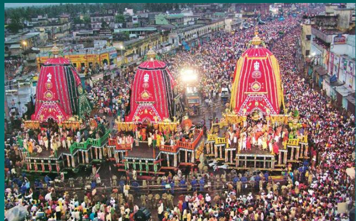
Devotees dancing in the Lord's love during Ratha Yatra

"Those souls who have taken refuge in the dust of Your lotus feet have no desire to attain heaven, universal dominion, the post of Lord Brahma, sovereignty over the earth, yogic perfections, or liberation."