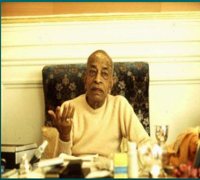
Srila A.C. Bhaktivedanta Swami Prabhupada

The chanting process offered by Lord Caitanya for achieving love of God is called saṅkīrtana .